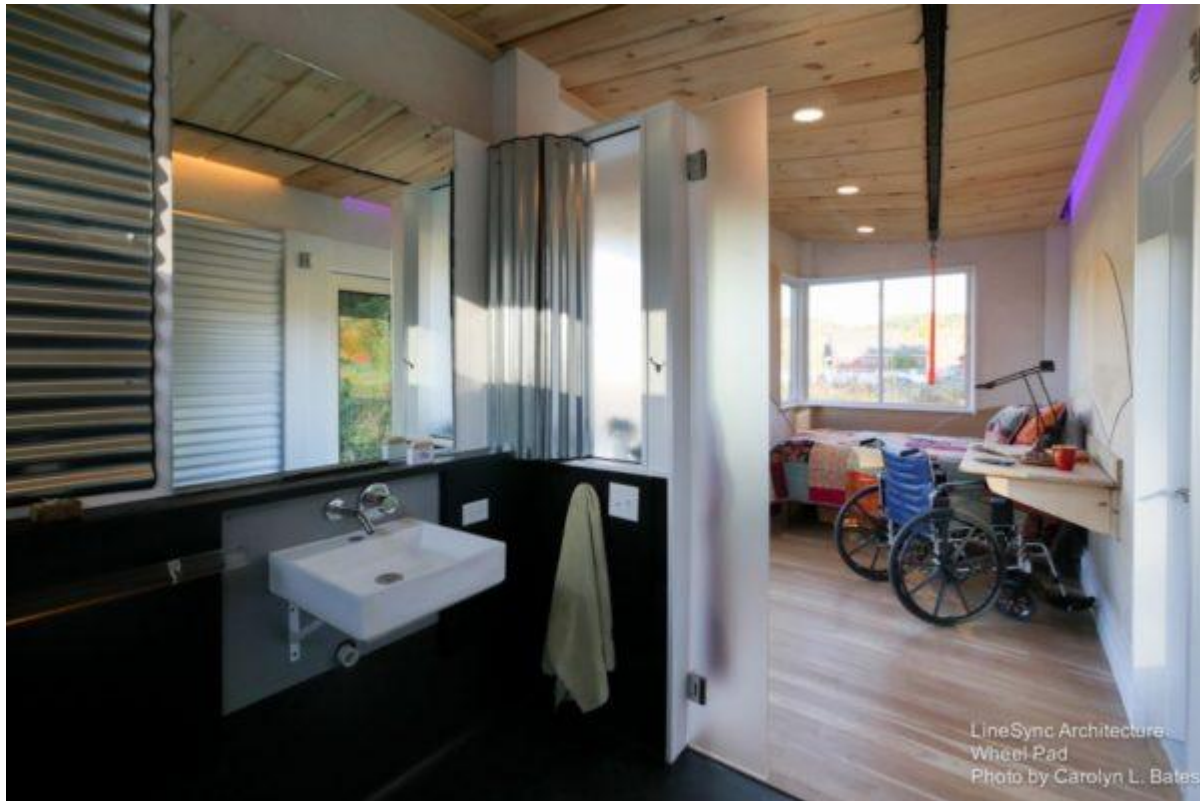
LineSync Architecture Wheel Pad

Check out this awesome tiny house that is wheelchair friendly: